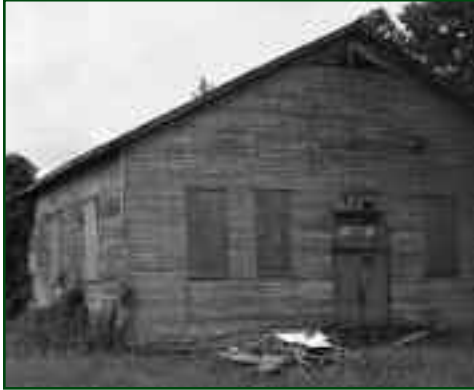
Rosenwald Schools, Pender Co.