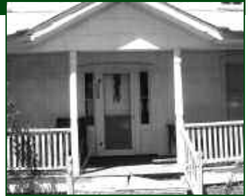
Historic Working Farms, throughout the Cape Fear Region