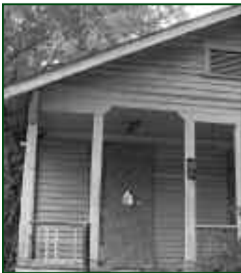
Affordable Historic Vernacular Houses, Wilmington, NC.