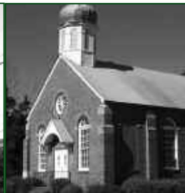
St. Peter and Paul Russian Orthodox Church, St. Helena, Pender Co.