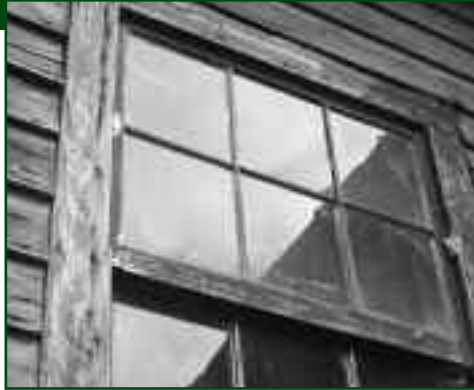
Historic Wooden Windows, Lower Cape Fear Region