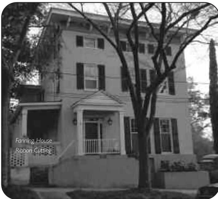
Fanning House Ribbon Cutting