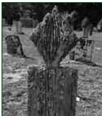
Wooden Markers, Cemeteries, Brunswick