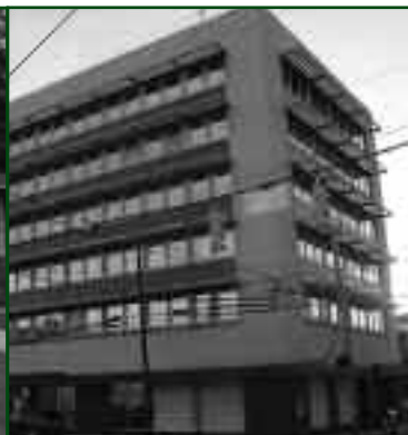
Tide Water Power & Light Building, 320 Chestnut Street, Wilmington, NC.