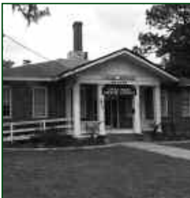
Lucile Shuffler Building/Sunset Park School, Wilmington