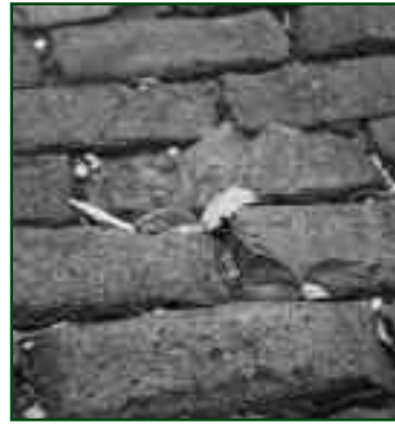
Brick and Stone Walls and Granite Curbs, Downtown Wilmington.