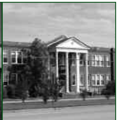
Former Topsail High School, Rte. 17, Hampstead, NC

For the full list and to nominate a place for the 2011 Most Threatened Historic Places List, please visit our website www.historicwilmington.org , or stop by our office for an application.